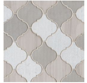
Louvre - LOU DECLUXLOUARA