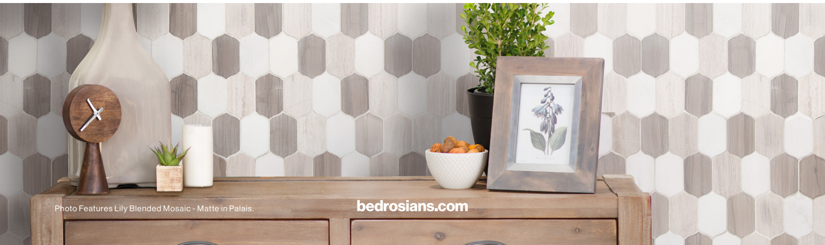
Photo Features Lily Blended Mosaic - Matte in Palais.