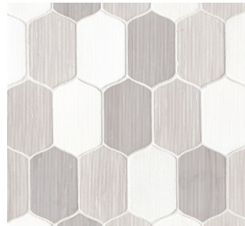
Palais - PAL DECLUXPALLIL