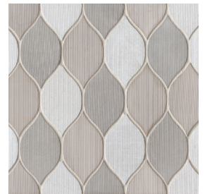
Louvre - LOU DECLUXLOUJAR