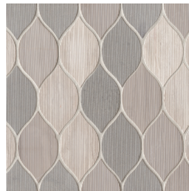
Paris - PAR DECLUXPARJAR