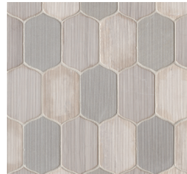
Paris - PAR DECLUXPARLIL