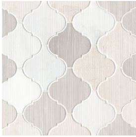
Tuileries - TUI DECLUXTUIARA