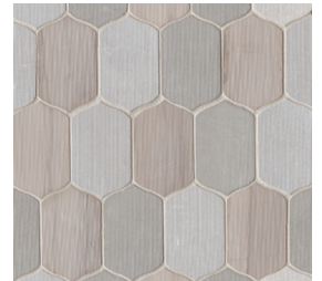
Louvre - LOU DECLUXLOULIL