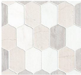
Tuileries - TUI DECLUXTUILIL