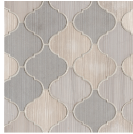
Paris - PAR DECLUXPARARA