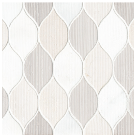
Tuileries - TUI DECLUXTUIJAR