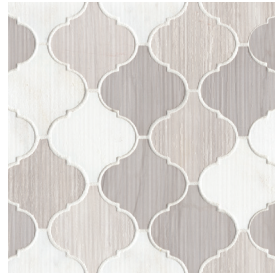
Palais - PAL DECLUXPALARA