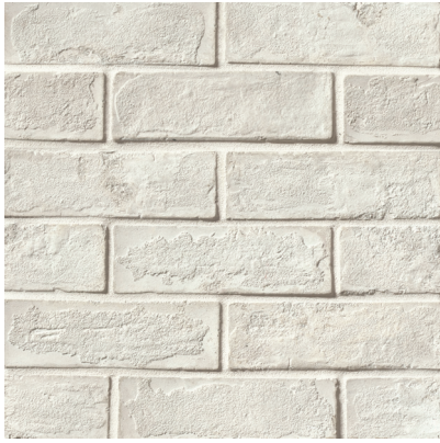
Early Grey - EAG DECAVOEAG28 - Brick