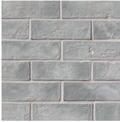
Sidewalk - SID DECAVOSID28 - Standard Brick