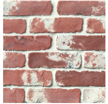
Used Red - USR DECAVOUSR28 - Antik Brick