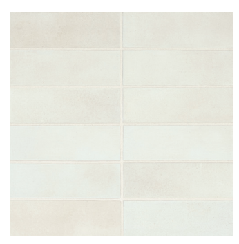
White - Matte