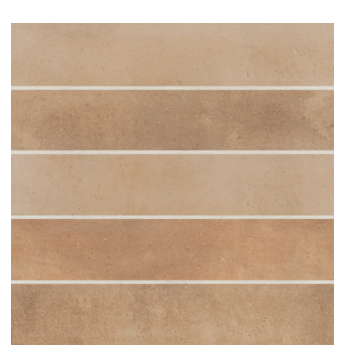
2 1/2"x12" Field Tile (Available in All Colors)