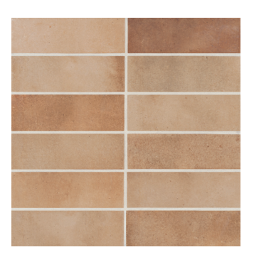
Cotto - Matte