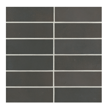
Black - Matte