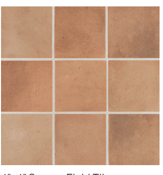
4"x4" Square Field Tile (Available in All Colors)