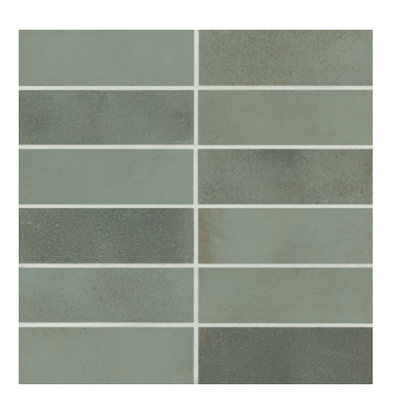
Sage - Matte