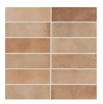
2"x6" Field Tile (Available in All Colors)