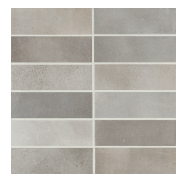
Greige - Matte