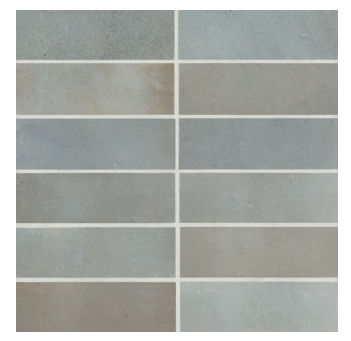
Blue - Matte