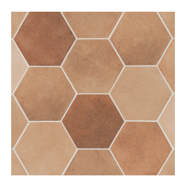
4 1/2"x4" Hexagon Field Tile (Available in All Colors)