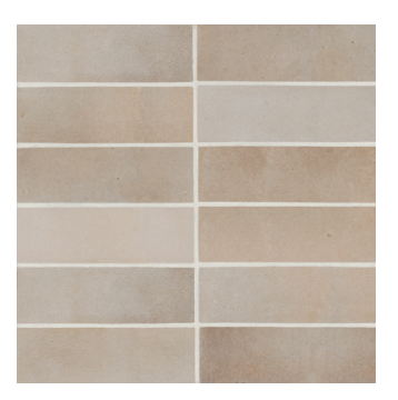
Taupe - Matte