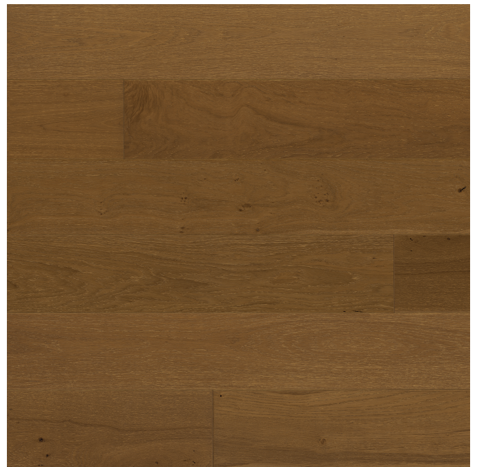
Brissac 100001246 - 7 1/2"x87 1/2" 9/16" Engineered Hardwood