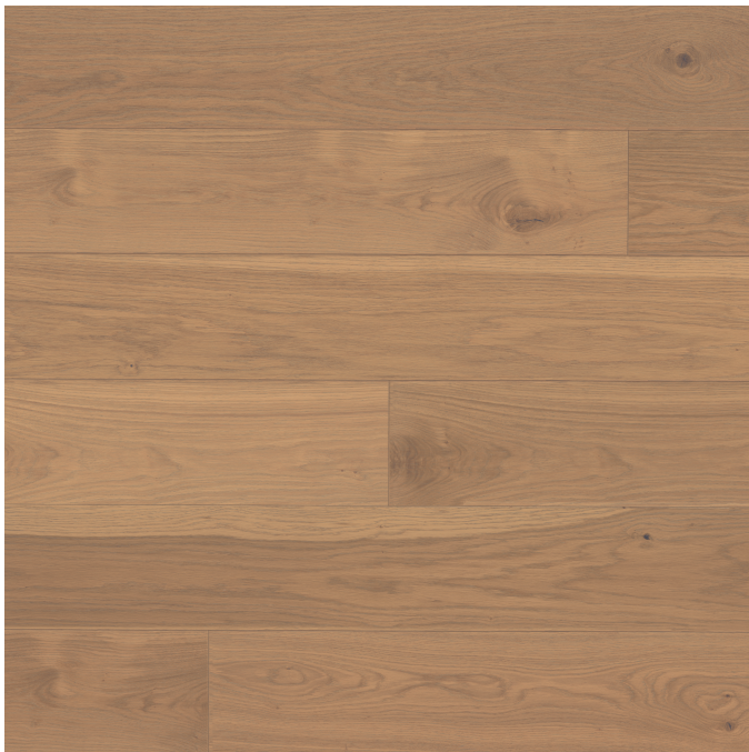
Margaux 100001245 - 7 1/2"x87 1/2" 9/16" Engineered Hardwood