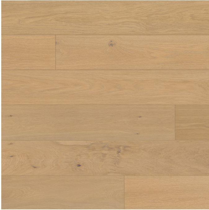
Chambord 100001244 - 7 1/2"x87 1/2" 9/16" Engineered Hardwood