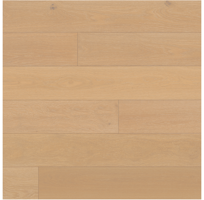
Tanlay 100001243 - 7 1/2"x87 1/2" 9/16" Engineered Hardwood