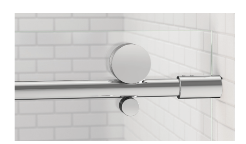
Vinesse Header and Roller