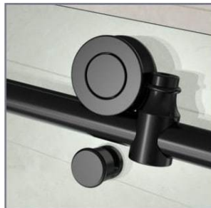
OIL RUBBED BRONZE (NOT AVAILABLE ON 72"W MODELS)