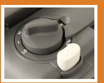
Top Mounted Controls

Designed to give safe heat in any room, Ashley Direct Vent heaters come in 3 sizes. They can be used as efficient zone heating or to complement your existing heating. They are easy to mount and require no ductwork for a quick installation. Everything needed is in the box. All 3 heaters are mobile home, Washington state and Canadian approved. The variable heat settings makes is easy to customize your comfort. These direct vent units are offered in natural or propane gas. Save time, with a simple, versatile installation that fits your home seamlessly.