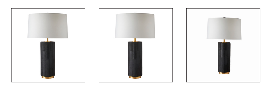
PTI10-894 H: 31 IN, Dia: 19.00 IN Black, Hide Contract Suitable As Is

Delivering a luxe, Hollywood Regency mood, the simplistic silhouette of the Cartwright is elevated through intricately patchworked black hair-onhide. The topstitched black column balances on an inset base of antique brass. Matching hide finial and off-white cotton drum shade. Finish will vary.