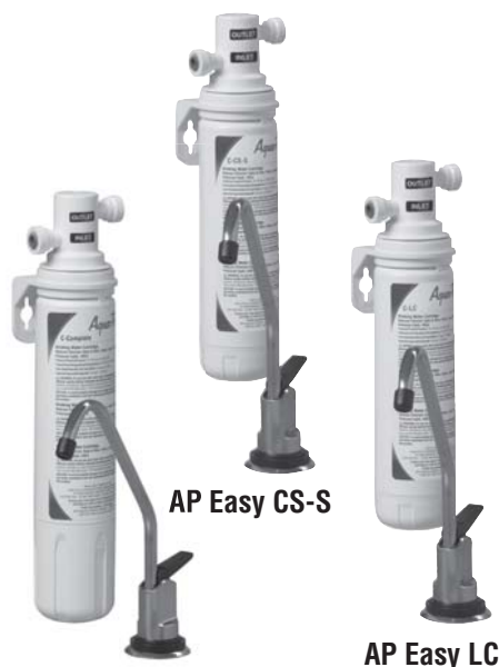
AP Easy Complete