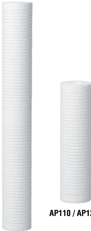
AP110 / AP124