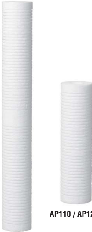
AP110 / AP124