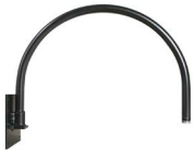
WM55 | 20 5/8" x 14 1/4"