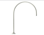
E9 | 28" x 40 5/8"