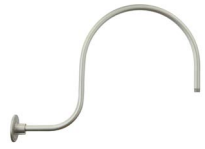
E18 | 27 3/4" x 21 3/8"