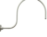
E18 | 27 3/4" x 21 3/8"