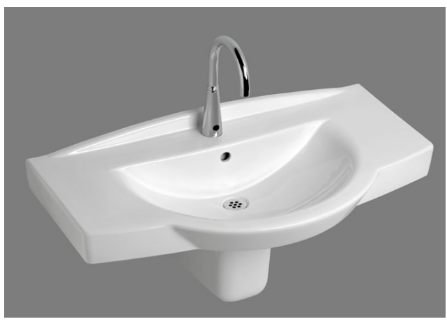
Shown: 0145.100 Lavatory center hole & shroud

MEETS THE AMERICANS WITH DISABILITIES ACT GUIDE-LINES AND ANSI A117.1 ACCESSIBLE AND USABLE BUILDINGS AND FACILITIES - CHECK LOCAL CODES. Top of front rim mounted 864mm (34") from finished floor.