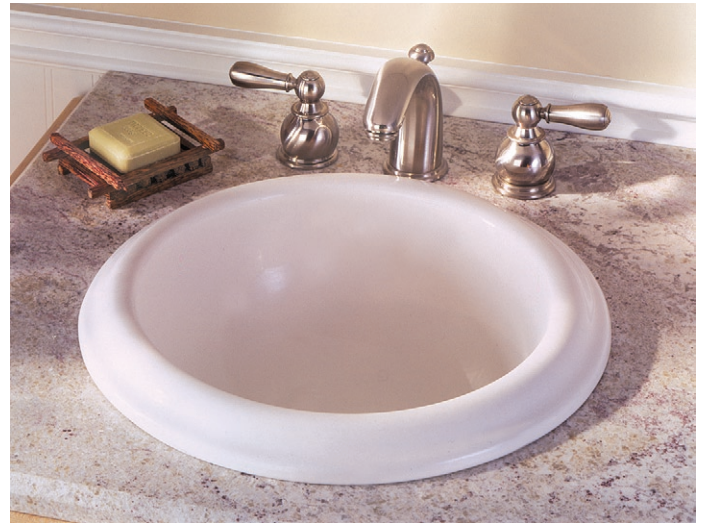
Shown with Hampton 8" Faucet (7881732.295)