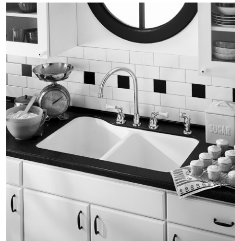
Undercounter Mount Installation (faucet not included)