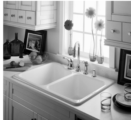
Top Mount Installation (faucet & soap dispenser not included)

SEE REVERSE SIDE FOR ROUGHING-IN DIMENSIONS