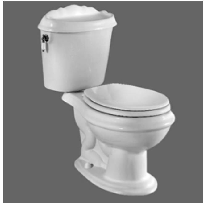
Shown with 5311.012 "Laurel" seat