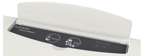
SELF-CLEANING TANK TOP DEVICE

SEE REVERSE FOR ADDITIONAL ROUGHING-IN DIMENSIONS