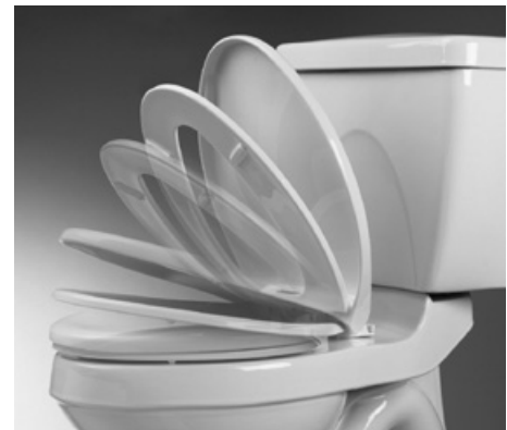
SHOWN: CONVENIENT SLOW CLOSE FEATURE