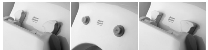
SHOWN: UNIQUE EASY LIFT OFF FEATURE