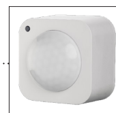
Spektrum+ PIR Motion & Luminance Contact Sensor