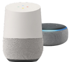
Voice Assistant (Not Included)