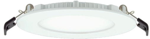
4" BRIO RGB+TW