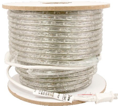
3/8" LED Flexbrite Bulk Reels 120V / 3/8" Diameter / 150ft Reel