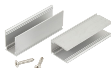
Mounting Clips (10) Aluminum Clips with (20) Screws