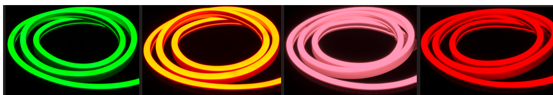
Green LEDs Opaque Green Jacket 520nm / Up to 25Lm/ft