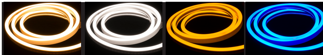
Warm White - 2700K Opaque White Jacket 79CRI / Up to 63Lm/ft