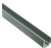
Mounting Channel Aluminum