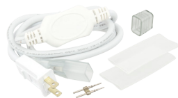
120V Power Connector Kit (1) 5ft Power Cord with fused plug and 8A inverter, (2) power pins, (1) end cap, and (2) 4" pieces of shrink tube