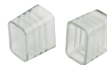
End Caps (10) Clear plastic end caps