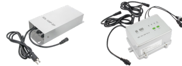
LED-RGB-15A-24V (Requires LED-RGB-CTRL-24V) LED-RGB-CTRL-24V (Requires LED-RGB-15A-24V) 24V DC Power Supply & RGB Controller 10A DC driver with 5ft power cord has mating connector for RGB controller; Allows for run lengths up to 65 feet; Must be used together