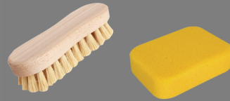
Brush or Sponge (Nylon or Wire)