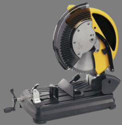
Miter Saw with Diamond Blade