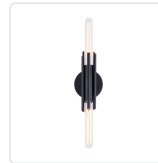
WV335811MB Matte Black