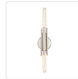
WV335811PN Polished Nickel