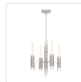
CH335019PN Polished Nickel