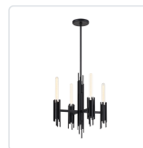
CH335019MB Matte Black