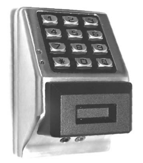
PDK3000 Remote Access Controller with PROX