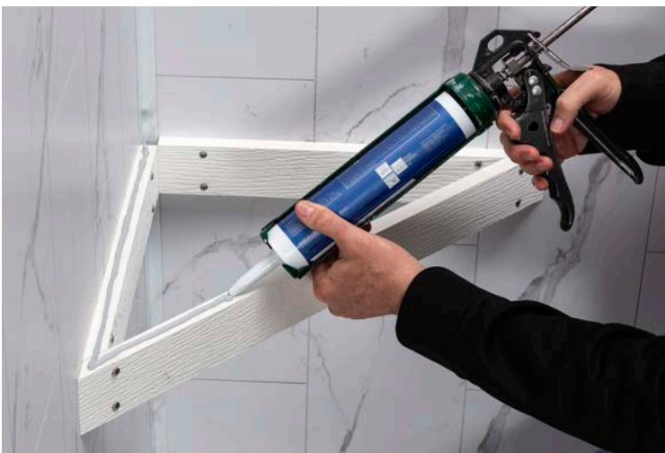
Apply a bead of adhesive along the top edge of the brackets.