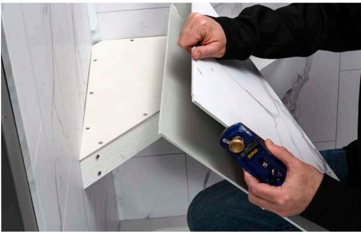
Use a plane and/or sand it to adjust the fit. Keep in mind you will need to adjust both the top and bottom of the bench.