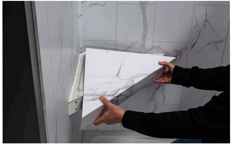
Carefully slide the bench into place.