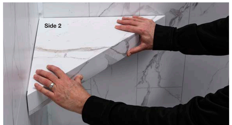
The second reason is to make sure it fits well against the wall on both sides. If not, you might have to plane and/or sand edges to adjust the fit.