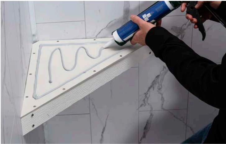
Apply adhesive to the sub-deck surface.