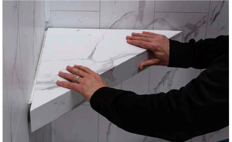
As you get closer to it being all the way in place, the sealant should start to push up to fill in between the wall and bench edge.