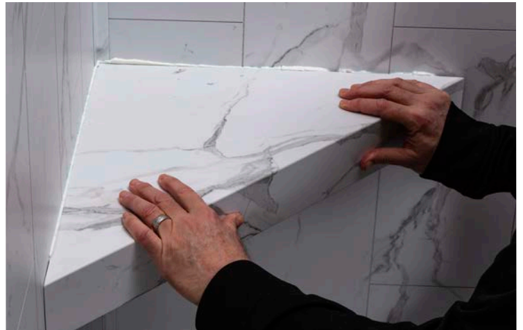
Wipe off any excess sealant that pushes out or add sealant in areas needed.