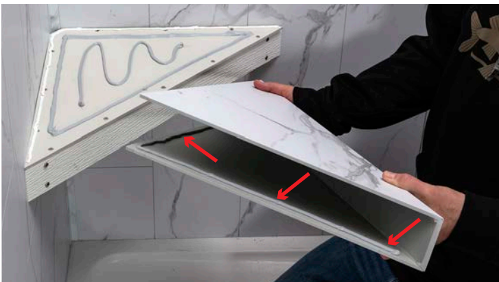
Apply adhesive just inside the edge of the bottom of the bench.

PALISADE ™ Waterproof, Grout-Free Wall Tiles