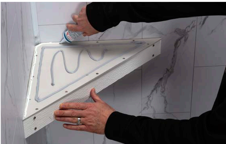
Apply a bead of sealant where the wall and sub-deck meet.