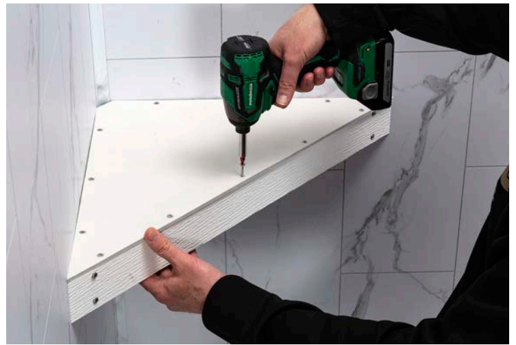
Use the sub-deck screws by placing them into the pre-drilled countersunk holes so the screws can be flush with deck surface.