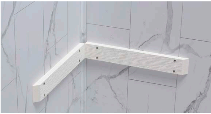
Complete the install of the second wall bracket by repeating the same process as with the first.