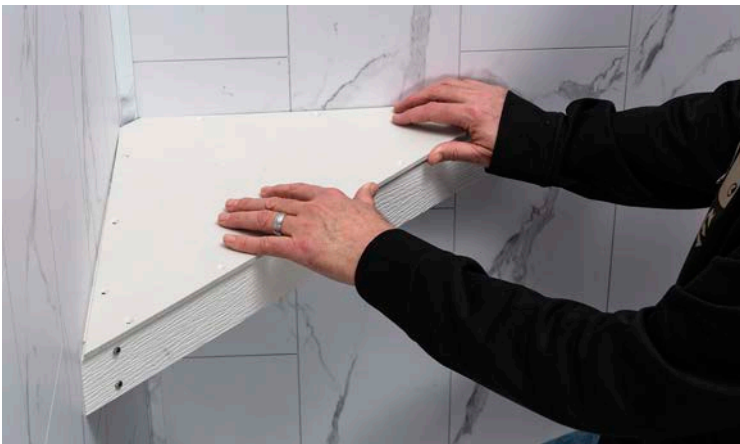
Place the sub-deck onto the brackets, counter-sunk holes facing up.