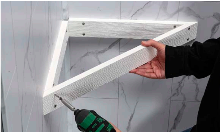
Install the cross bracket using the pre-drilled holes for screw locations.