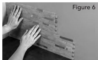
Do not apply pressure until you are sure of your placement