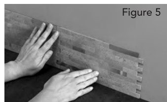
Place each section as if placing a puzzle piece