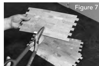
Cut the tile using tin snips or other cutting tools

Cut the tile using the recommended cutting tools (figure 7). Take the cut tile to the work space and place it in its intended location, ensuring it fits properly. Cut and install all remaining tiles using the same steps described above.