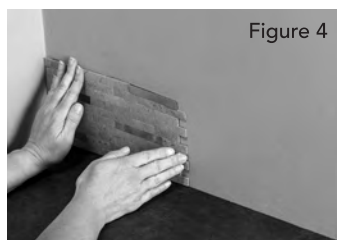
Lightly place the tile on the wall