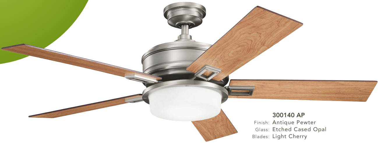
300140 AP Finish: Antique Pewter Glass: Etched Cased Opal Blades: Light Cherry