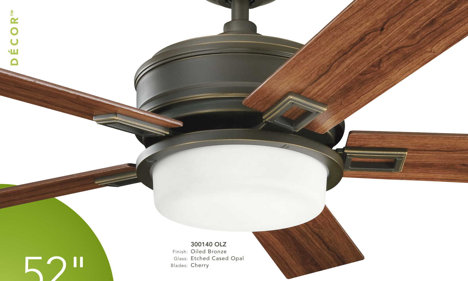
300140 OLZ Finish: Oiled Bronze Glass: Etched Cased Opal Blades: Cherry