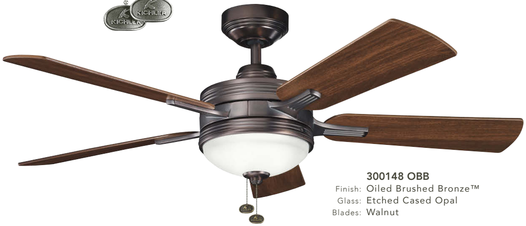
300148 OBB Finish: Oiled Brushed Bronze™ Glass: Etched Cased Opal Blades: Walnut