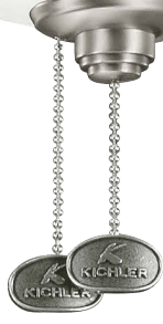
300148 AP Finish: Antique Pewter Glass: Etched Cased Opal Blades: Dark Cherry