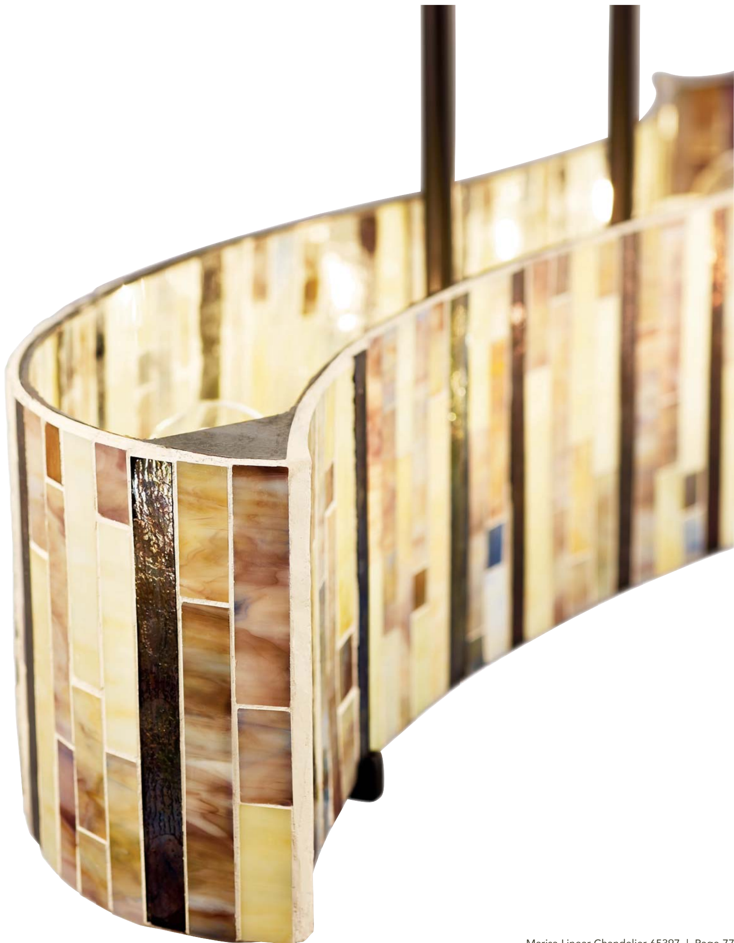
Marisa Linear Chandelier 65397 | Page 77