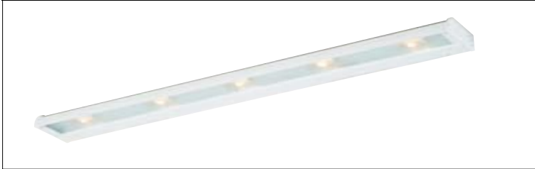
5 Lamp 40" (40"L x 5"W x 1½"H)