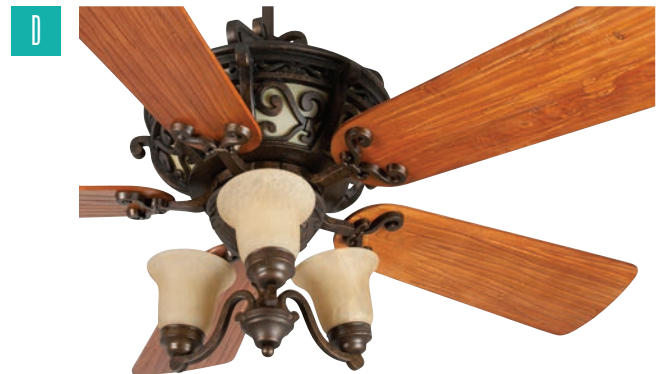
A Peruvian Toscana with 56" Custom Carved Chamberlain Walnut Blades and Light Kit Model-Finish TO52PR Blade-Finish B556C-CH10 Light-Finish LK50CFL-PR