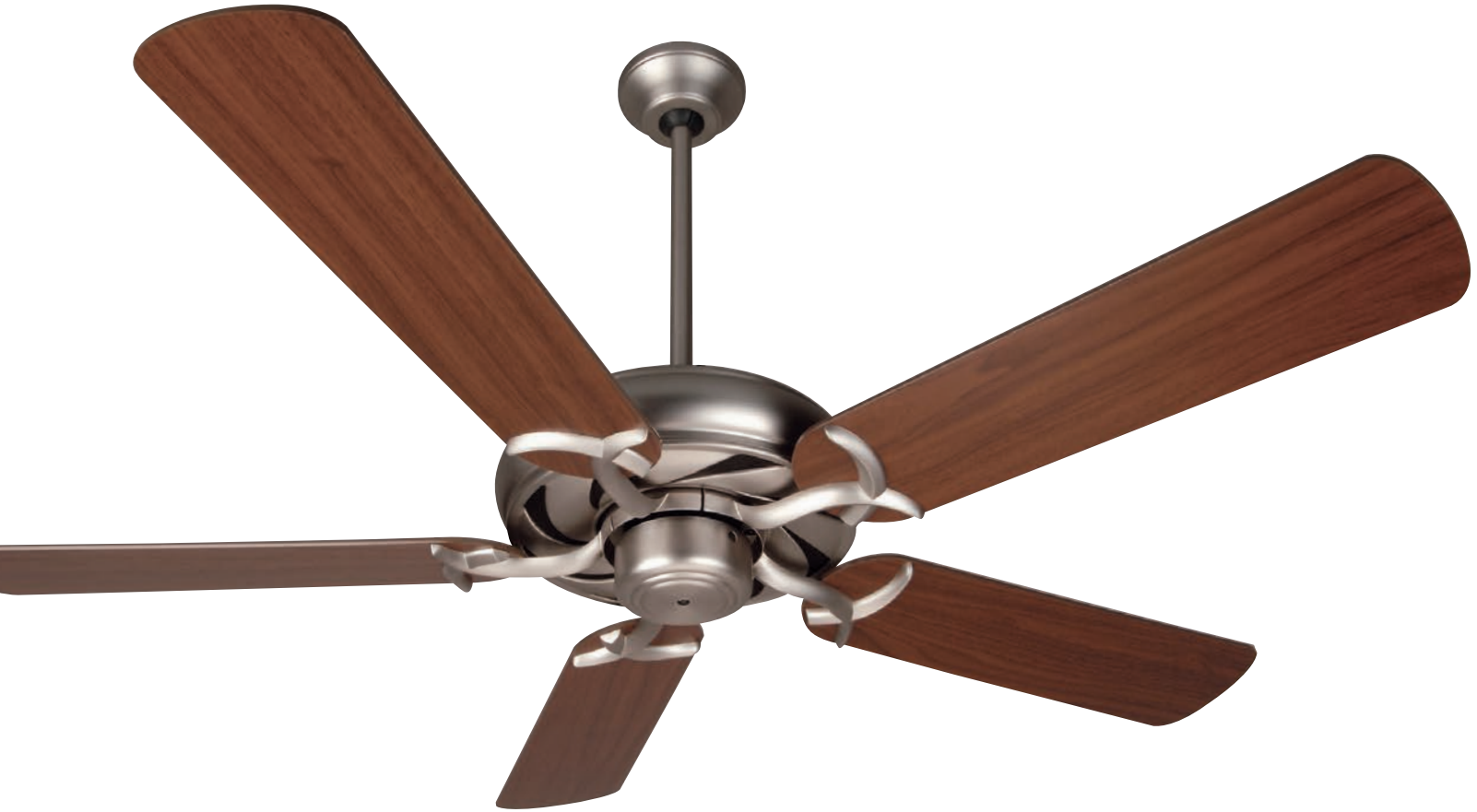
Brushed Polished Nickel Civic with 52" Plus Series Walnut Blades | Model . . . CI52BN Blade . . . . B552P-WB6 Light . . . . Not Shown