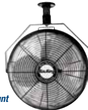
Ceiling Mount 9718