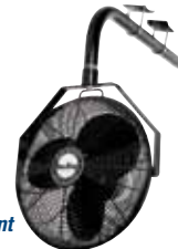
I-Beam Mount 9618