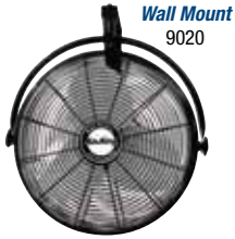
Wall Mount 9020

Secondary support cable included on Wall, Ceiling, and I-Beam Mount models.