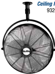
Ceiling Mount 9320