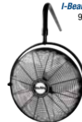
I-Beam Mount 9520