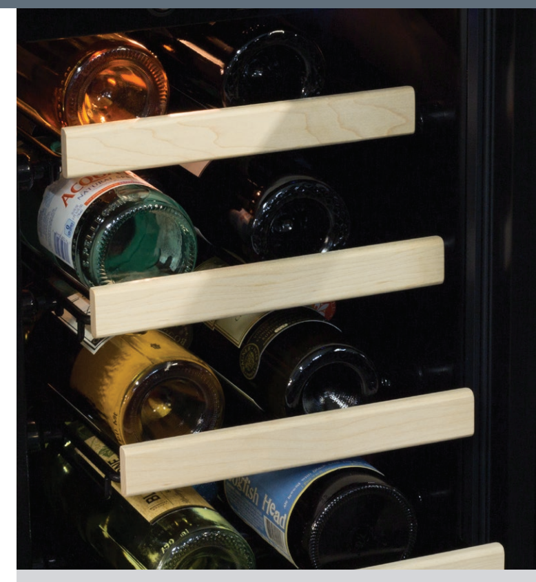
This slim 15-in Marvel Wine Refrigerator stores 23 bottles, and it's engineered to defend against the common enemies of wine, like damaging light, heat and vibration.

• 1-year parts and labor warranty and 5-year sealed system parts warranty