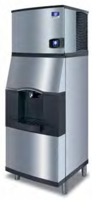
Indigo NXT iT0450 Ice Machine SPA-310 Ice Dispenser

With Indigo and Indigo NXT ice machines you can program the ice machines to be off certain hours of the day so that while the hotel guests are sleeping, the ice machine can be too!