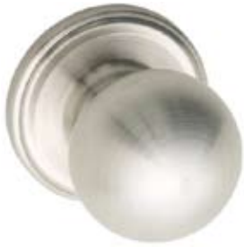
BK 2000 Series Ball Style