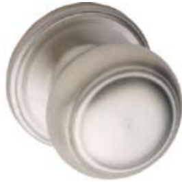
CK2000 Series Colonial Style