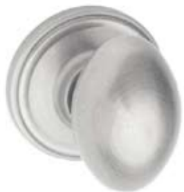
EK2000 Series Egg Style