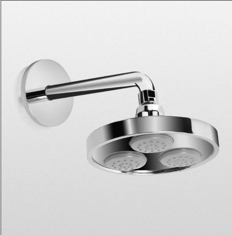
TS100AL#CP - Trilogy® Showerhead