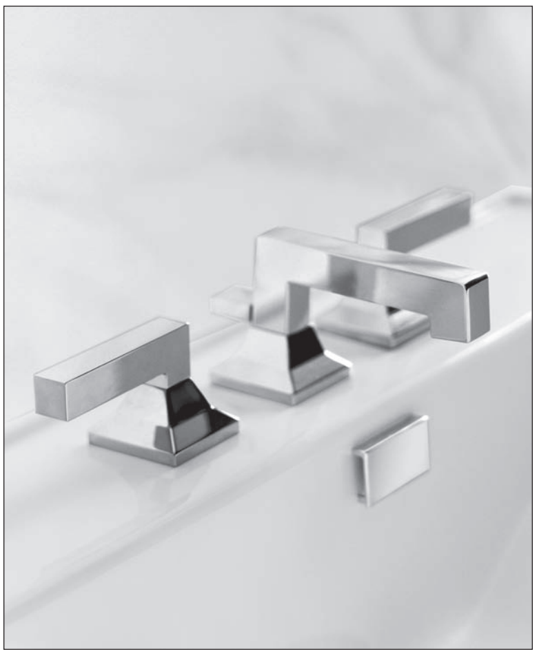
TL930DD#CP - Lloyd™ Widespread Lavatory Faucet