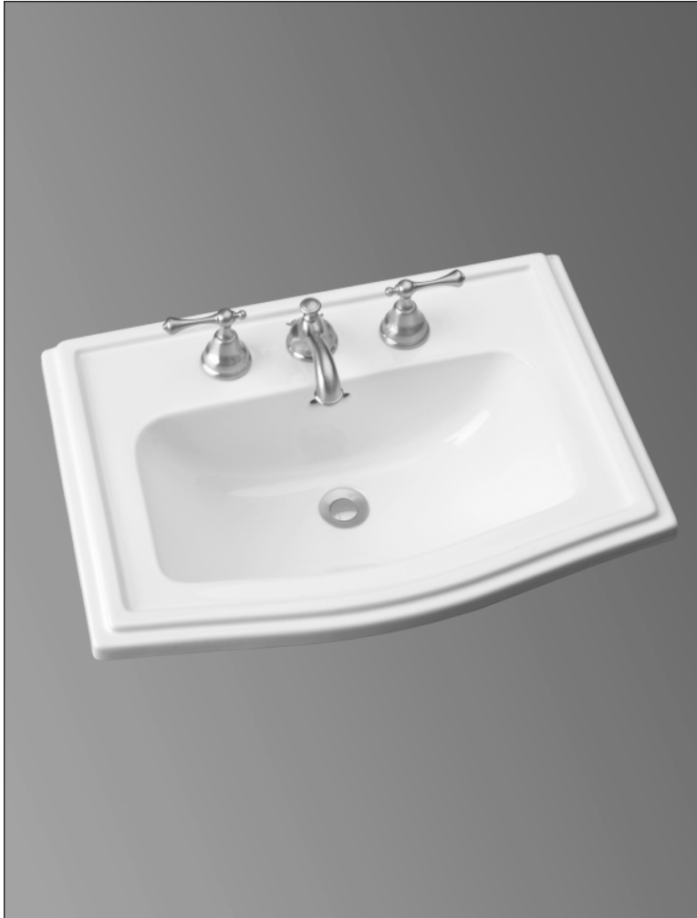
LT781.8 - Baldwin Self-Rimming Lavatory