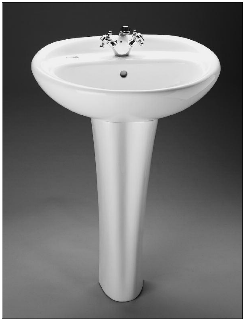
LPT620 - Pedestal Lavatory