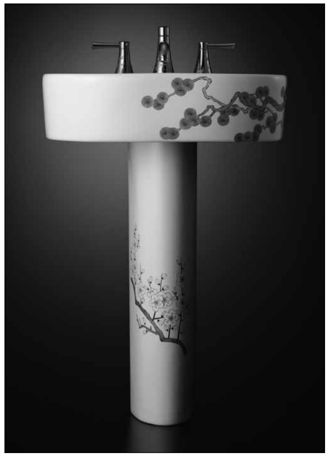
Sold separately Waza Miyabi Lavatory Faucet - TL794DD#RS-K1

The lavatory shall be 24" length and 17-3/8" depth. The basin shall be 15-3/4" length and 11" width. The lavatory shall be made of vitreous china and be 34" universal height with rear overflow. Lavatory shall be TOTO Model LPT790.8#01-PP.