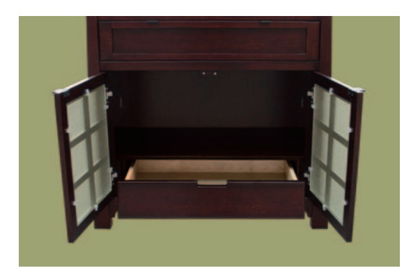
Ample interior storage space and drawer. Doors feature interchangeable glass or wood panel inserts.