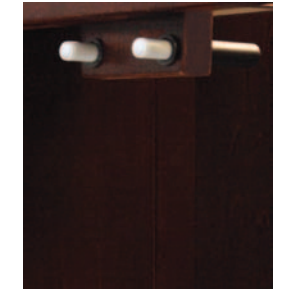
Doors feature a softclose mechanism.