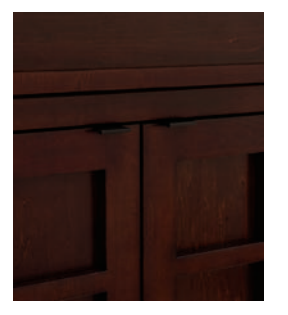
Inset doors and drawers.