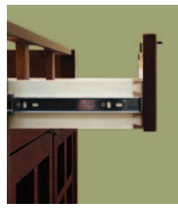
Solid wood drawers with full-extension slides.