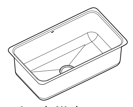
Lancelot Undermount Single Bowl Sink Model: $22362 (UMTL-29"x16"x10")

• Warranted for fifteen years against material or manufacturing defects