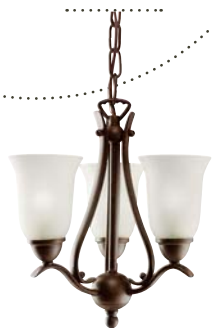
Shown as Mini Chandelier 11.5" H.