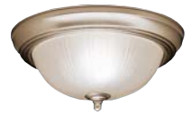
D | 8653 NI, TZ Flush Mount