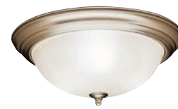
L | 8655 NI, TZ Flush Mount