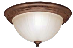
F | 8654 NI, TZ Flush Mount