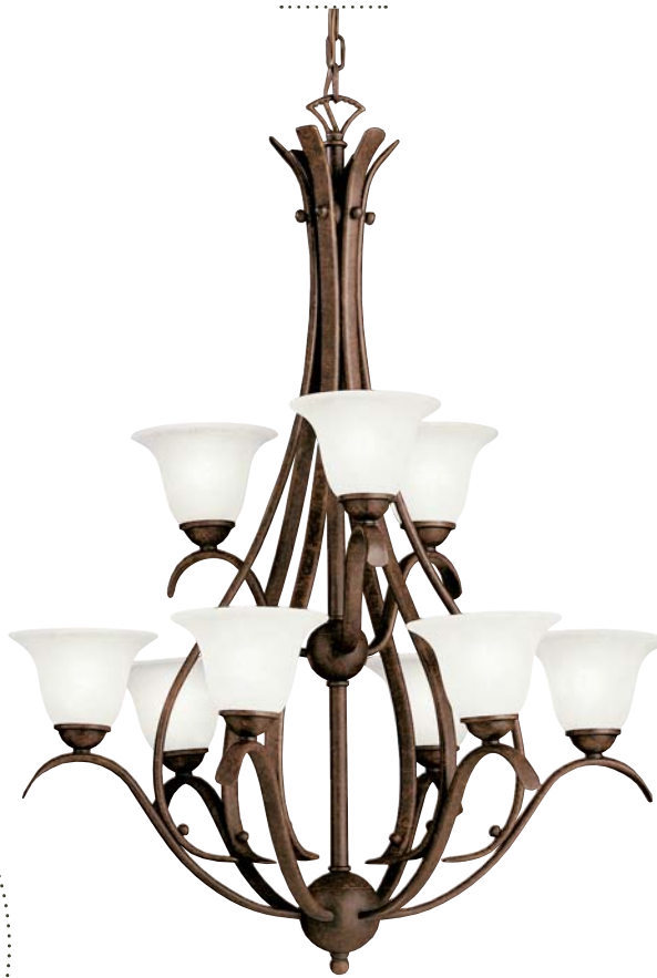
C | 2520 NI, TZ Chandelier