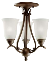
Shown as Semi Flush 11.75" H.