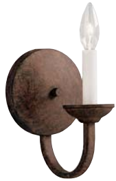
A | 6620 TZ Wall Sconce

BRUSHED NICKEL OR TANNERY BRONZE™ FINISH WITH ETCHED SEEDY GLASS