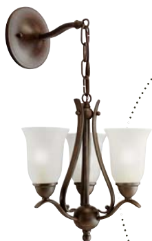
Shown as Wall Mount 17.75" H.