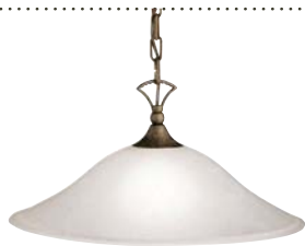
H | 2702 NI, NIS, OZ, TZ Pendant