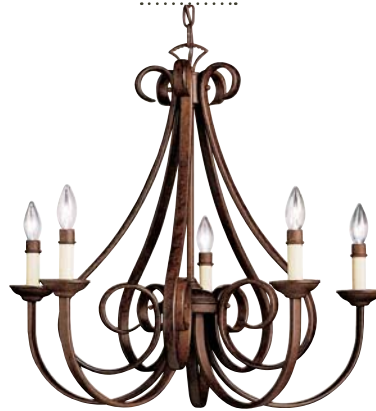
E | 2021 NI, TZ Chandelier