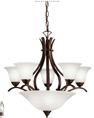
G | 2018 NI, TZ Chandelier