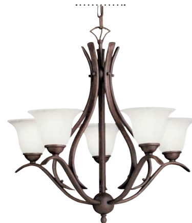
O | 2020 AB, NI, TZ 10320 NI, TZ Chandelier