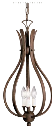
N | 2531 NI, TZ Small Foyer Pendant