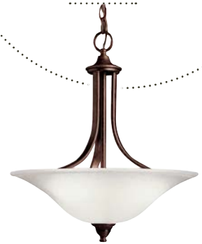
Shown as Inverted Pendant - 19" H.