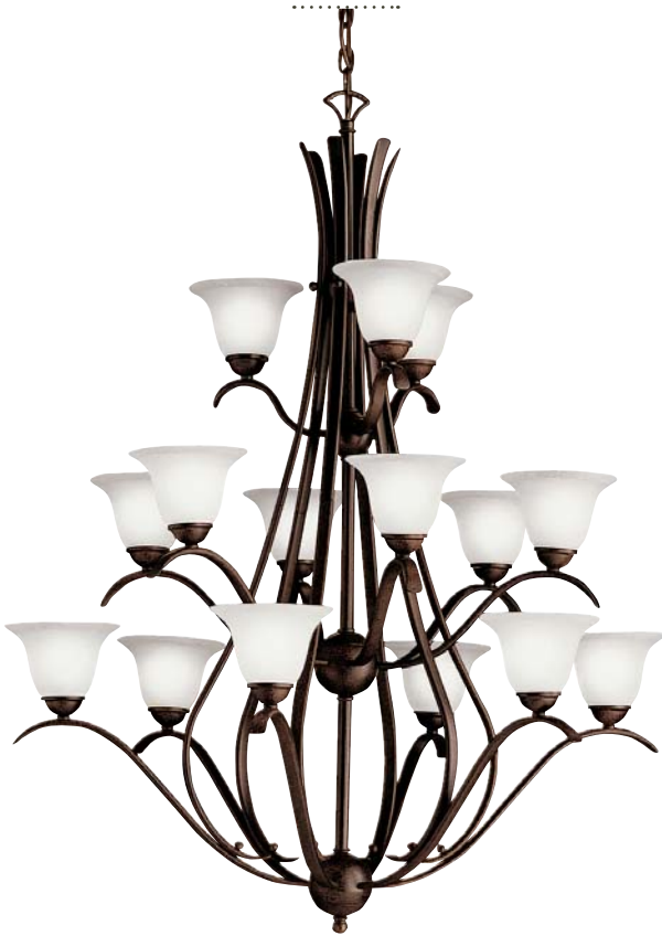
D | 2523 NI, TZ Chandelier