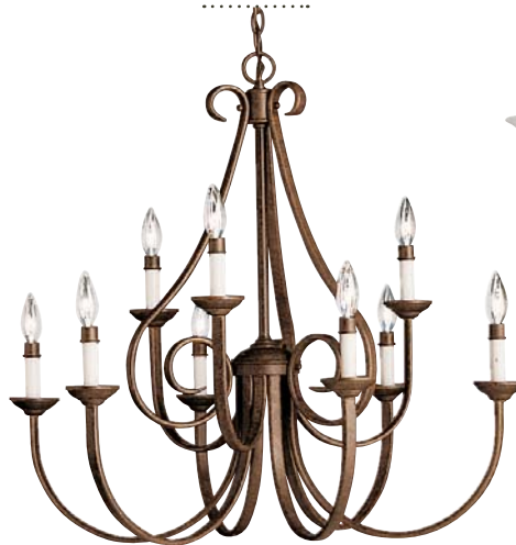
F | 2031 NI, TZ Chandelier