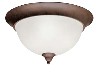
G | 8065 NI, TZ Flush Mount