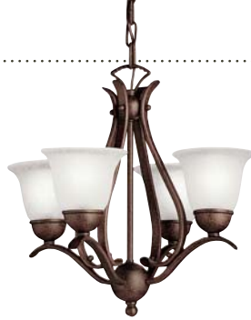
B | 2019 NI, TZ Mini Chandelier