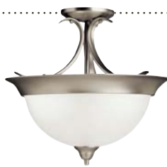
K | 3623 NI, NIA, OZ, TZ 3623 NIFL, OZFL, TZFL Semi Flush