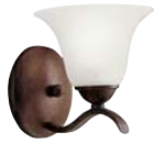
A | 6719 NI, TZ 10618 NI, TZ Wall Sconce

ANTIQUE BRASS, BRUSHED NICKEL, TANNERY BRONZE™ OR OLDE BRONZE® FINISH WITH ETCHED SEEDY OR ALABASTER SWIRL GLASS