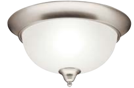
E | 8064 NI, TZ Flush Mount