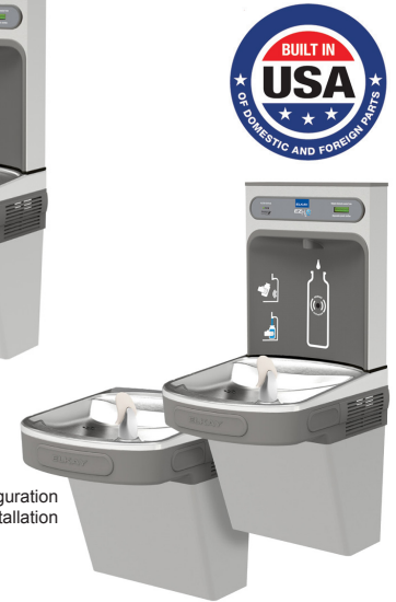
*Versatile cooler configuration alternate installation