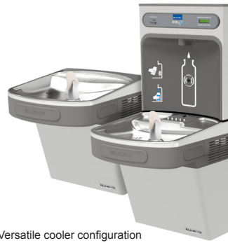
*Versatile cooler configuration as shipped